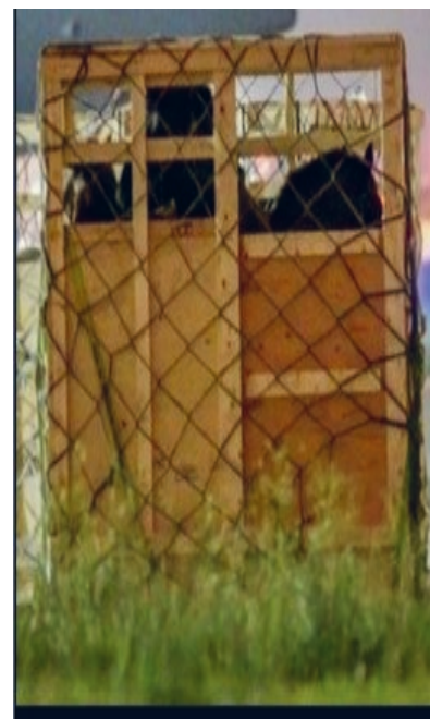
Crated horses await air transportation.

transparency regarding the treatment of these horses once they reach their destination is a deep concern that cannot be denied. I am happy to support this Bill and advocate for the humane treatment of horses.