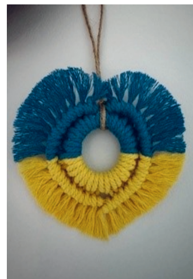
Ukrainian ornament from the Lord Roberts Holiday Craft Market.

was reminded of the significant ties to Ukraine in this riding. It is an honour to strengthen the bond between our two countries by voting for this agreement that helps our allies during this time of great need.