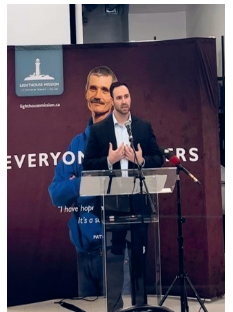
Speaking at the funding announcement at Lighthouse Mission.

and other STBBI. In addition, the recent Fall Economic Statement commits to making counselling and psychotherapy exempt from the GST and HST. I remain committed to supporting the needs around mental health and addiction services.