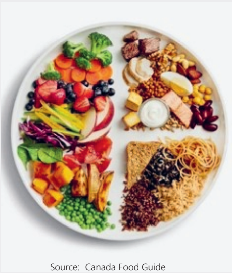
Source: Canada Food Guide

that we do our part to deal with the tragic consequences that poverty brings to communities. I hope that we can find bipartisan support for this piece of legislation. We may have differences, but surely we can all agree that it is important that a nutrition program exists in our schools.