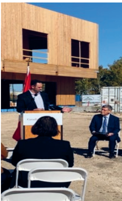
Announcing the $12.4 million Federal Government investment in the construction of Buffalo Crossing Centre.