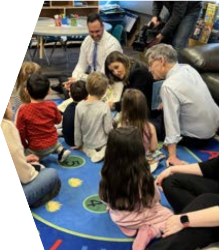
Ben, MP Terry Duguid, and Minister of Finance, Chrystia Freeland, attend a childcare funding announcement.