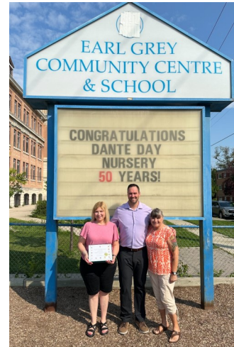
Celebrating the anniversary of a local community and childcare centre.

In 2024, we invested more than $460,000 in community and childcare centres in Winnipeg South Centre through the Canada Summer Jobs Program—that’s 91 summer jobs in your community! I am committed to these ongoing investments in children and families.