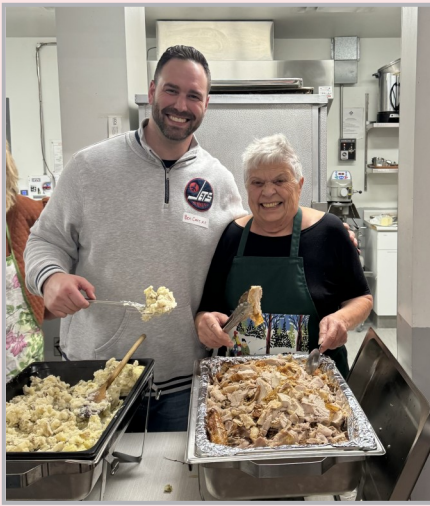
Serving dinner at the Riverview Community Centre Fall Supper