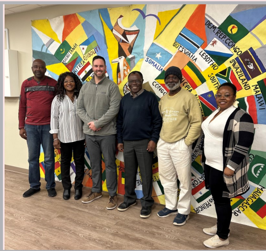
Meeting with Board Members of ACOMI (African Communities of Manitoba INC)