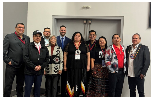
Meeting with First Nations Chiefs and Grassroots members from Manitoba.

Bill C-61 marks a critical step for reconciliation that meaningfully addresses some of the most egregious wrongdoings of the past 150 years.