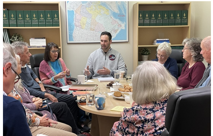
Meeting with the Winnipeg South Centre Older Adults' Council

I have always admired the way the role of the Elder is elevated and celebrated in Indigenous cultures. Older Adults have so much lived experience and wisdom. I value their opinions and perspectives on the issues affecting our community and country.