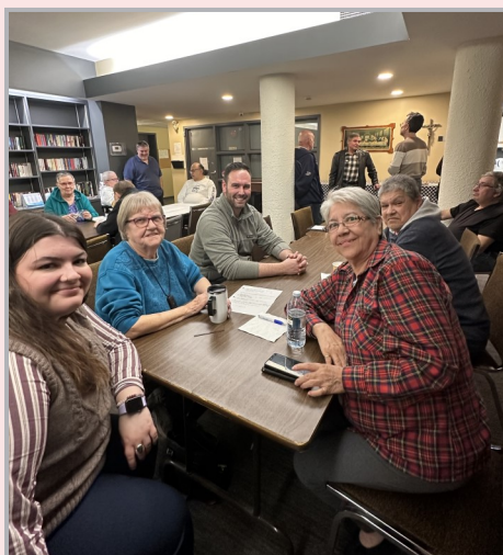
Visiting with residents at St. John's Haven