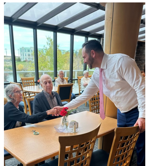
Visiting with residents at Sterling House