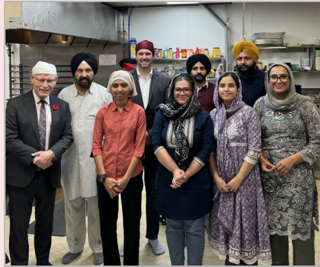
Meeting with Community Leaders at the Winnipeg South Sikh Centre during Diwali