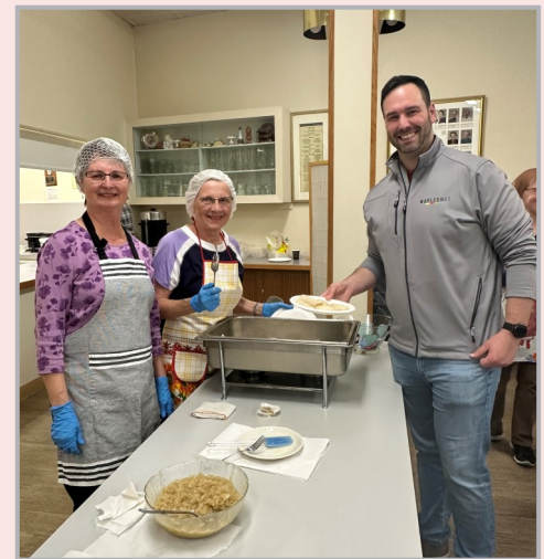
Enjoying a Perogy Dinner at Holy Family Ukrainian Catholic Church