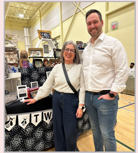
At the Linden Woods Community Centre Craft Sale