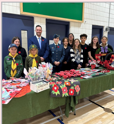
Joining École Van Walleghem School for their Remembrance Day Ceremony