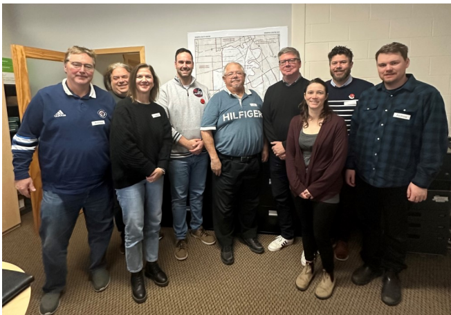
Meeting with Community Centre Presidents and Managers

Recently, I met with the Presidents and Managers of the Community Centres in our riding. They are ambassadors for their neighbourhoods. Engaging with them helps me to better understand the needs of the grassroots of our riding and how the Federal Government can be an ally. I was proud to support our Community Centres by funding 23 summer positions through the 2024 Canada Summer Jobs Program. This made it possible for local organizations to meet their capacity, while giving youth unforgettable and valuable work experiences.