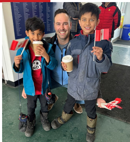
Handing out Canada flags at Linden Woods Community Centre.

I look forward to joining residents in Winnipeg South Centre on July 1st!