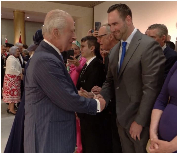
Ben meeting King Charles III following the Throne Speech.

The speech itself is not written by the Monarch, but rather the Government. The purpose is to signal the broad direction of its agenda.